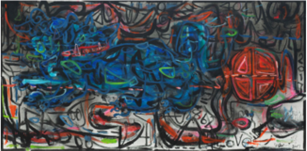
Niu An (b.1968), Lion Series-CARPEDIEMDIEM , 2017, Acrylic on canvas, 39 x 79 inches (100 x 200 cm)