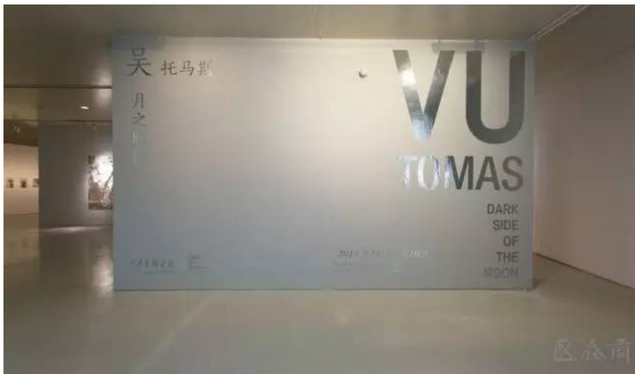
Entrance of the exhibition