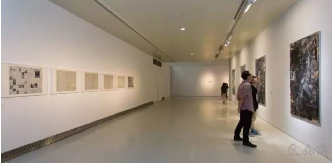
Exhibition View of Dark Side of the Moon

These futuristic landscapes discuss the technological advances of man. Vu is very interested in the effects of technology, both for good and bad. He plays with the roles of man and machine, discussing the dissolving line that separates the two.